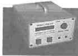
Simultaneous Short-term Testing